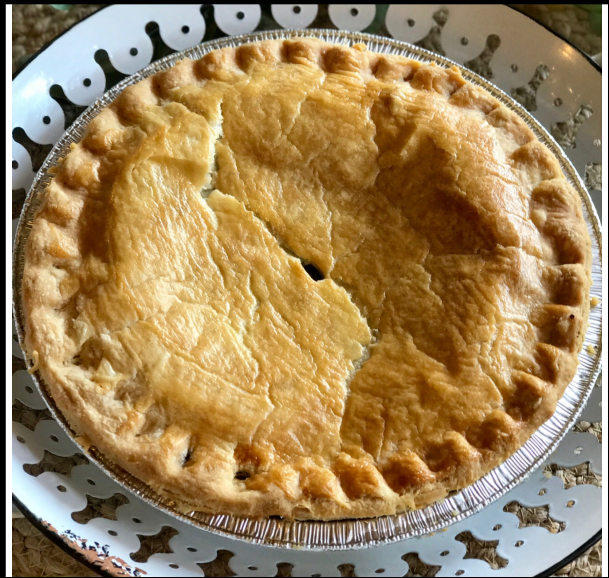
Marion Blackberry Pie $20

A delicious apple filling and a hint of cinnamon inside our flaky pastry crust. Topped with a rich crumb topping. * Available Gluten Free