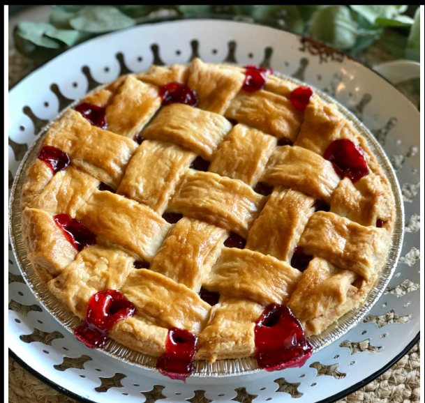
Cherry Pie $20

Layers of plump Marion Blackberries and cream cheese filling inside our flaky pie crust, then topped with a rich crumb topping. * Available Gluten Free