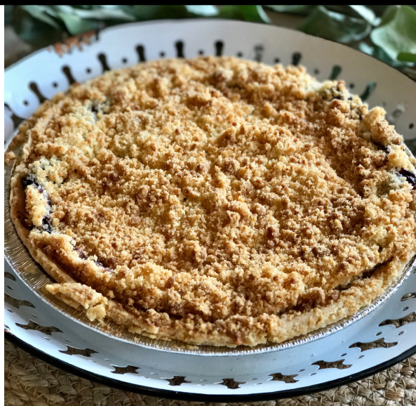
Berry Cream Cheese Pie $20

Plump Marion Blackberries baked inside our flaky pastry crust.