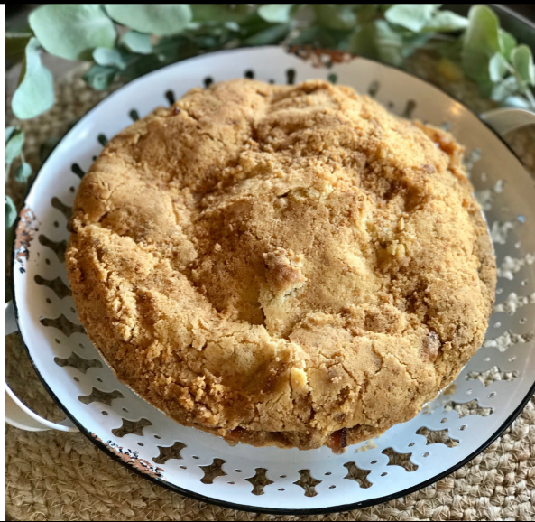
Dutch Apple Pie $20

A delicious apple filling and a hint of cinnamon inside our flaky pastry crust. Topped with a rich crumb topping. * Available Gluten Free